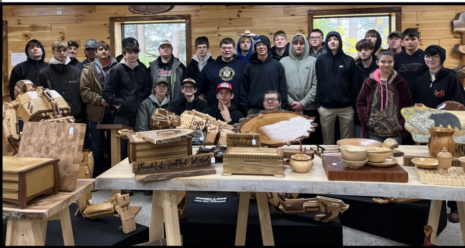
Construction Trades class visting Janish Woodworks in Whittemore during the Manufacturing Day field trip.

activities. Our second trip, trades students participated in the manufacturing day career exploration sponsored by Michigan Works where they attended a field trip to Janish Mill and woodworking shop in Whittemore, Michigan. Students gained knowledge of different grades of materials used within our industry and how the materials we use on site are manufactured.