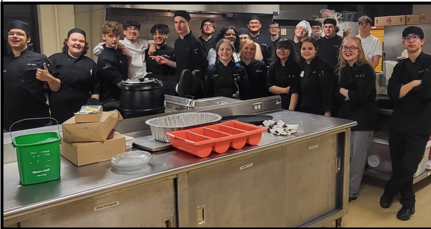
(left) Students gathering after another successful annual Thanksgiving dinner.

We had lots of fun preparing and prepping food with lots and lots of pies and turkey!