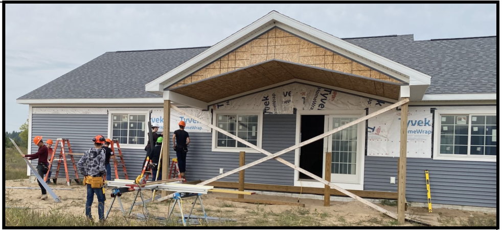
(above) Oscoda and Whittemore-Prescott students installing siding to the house project.

Outside the classroom construction trades students continued with the construction of our housing project. Students over the last few months engaged in finishing the exterior siding (right), garage door installation, deck construction, and installation of the interior walls. Currently students are assisting with the installation of the electrical wiring, HVAC, and plumbing working side by side with local contractors. As we move into the new year, students' classroom and on-site learning practices will focus on construction finish skills and activities with a target project completion date of June 2023.