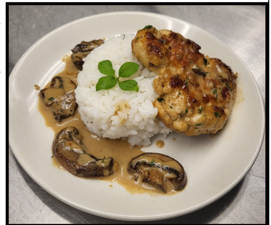
(above) Students made and plated Chicken Marsala.