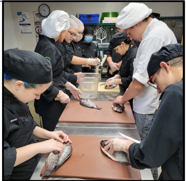
(above) Students learning the proper techniques of filleting and skinning fish.

We are now getting started on their ProStart State Invitational competition categories to compete in. We have students signed up for; culinary - where they have a team of 4 prepare an appetizer, entre with a side and a dessert in one hour, with no electricity and only two butane burners to use. Then we have students signed up for table top design where they have a theme to create and design a menu and set a beautiful table setting for eight. We also have a team signed up for nutrition - where they have 30 minutes to make a child's menu that follows the nutritional guidelines, and then a team for our ServSafe Knowledge bowl, jeopardy style. This should be a good competition year in Port Huron. This is open to the public to watch and free of charge, so come watch what they have learned in class and cheer them on!