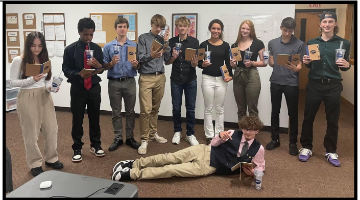
(above) Students received gifts from Minth Plastic Trim International– Human Resources when they came to speak to the class.

Business students have begun to work on their big project for the year. All students have to create a business and come up with a formal business plan. This includes all marketing materials, slogans, products, catalogs, prices, etc. All students completed a formal and useful resume and cover letter that they will be able to utilize in their future careers!